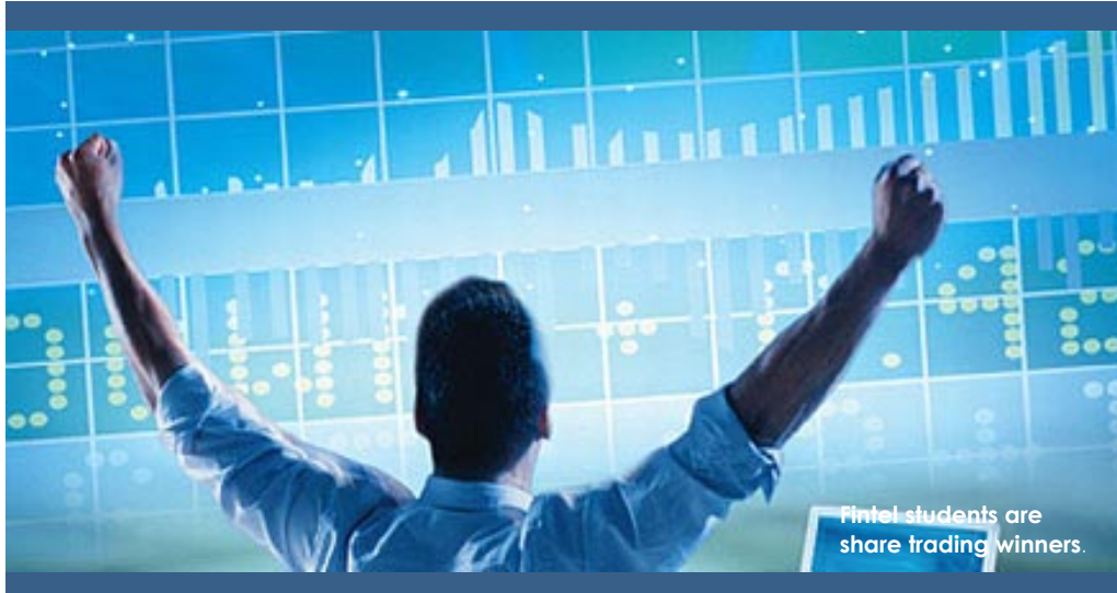
Fintel students are share trading winners.